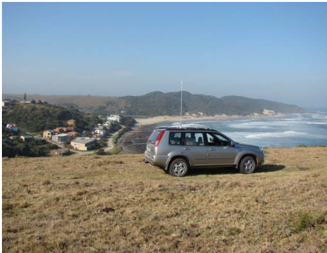
Valery's (ZS2VJJ) mobile with HF antenna. Note the view he has every day.